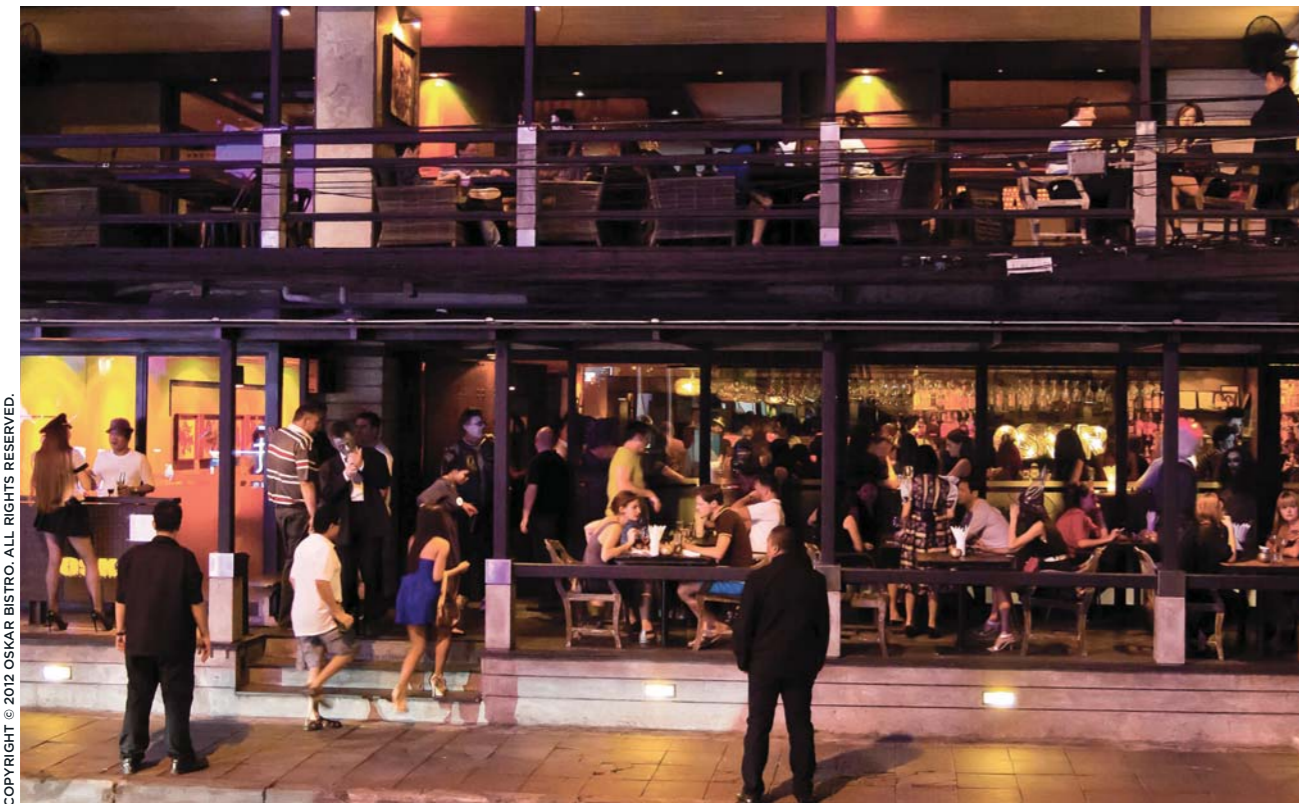
COPYRIGHT © 2012 OSKAR BISTRO. ALL RIGHTS RESERVED.