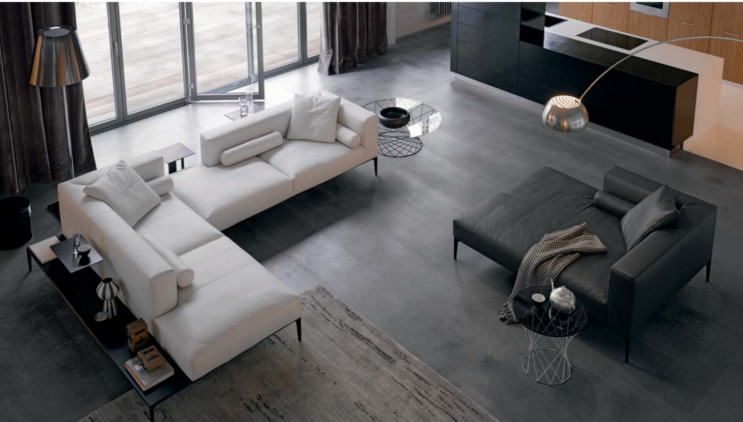
Jaan Living. Cosmopolitan elegance for a modern lifestyle. This sofa is a dream come true thanks to its softness that you could literally sink into for ever and ever. Casual – the look of the leather, practical – the matching boards. Design: EOOS.