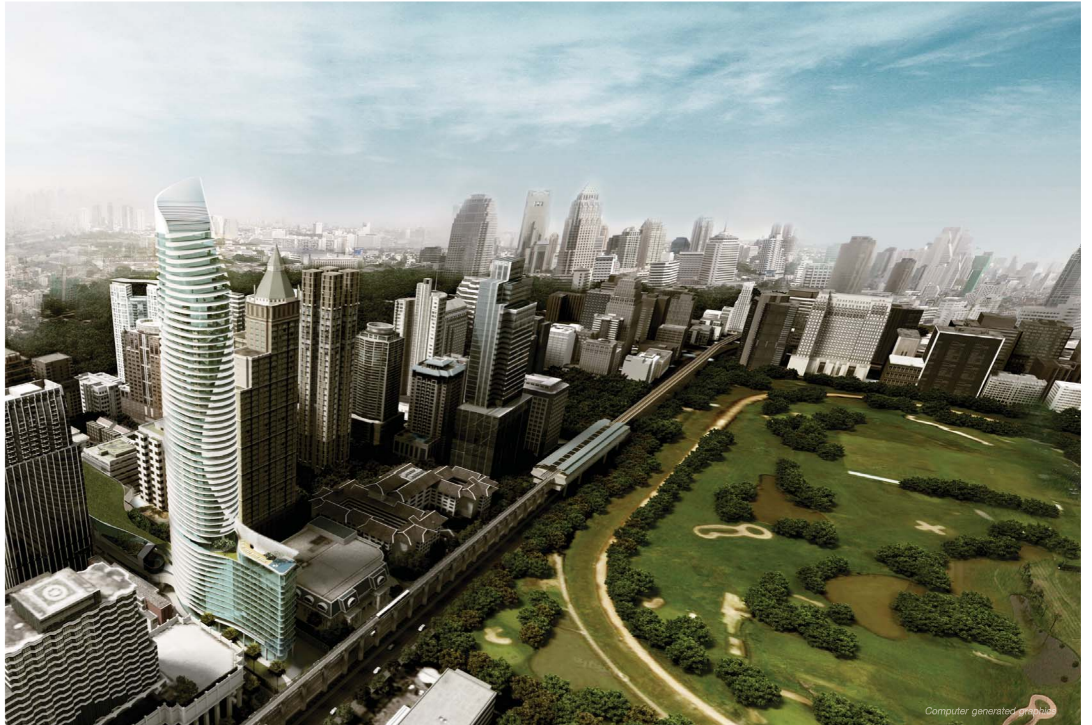
Computer generated graphics

A luxury collection of inspired homes along Bangkok's most prestigious boulevard