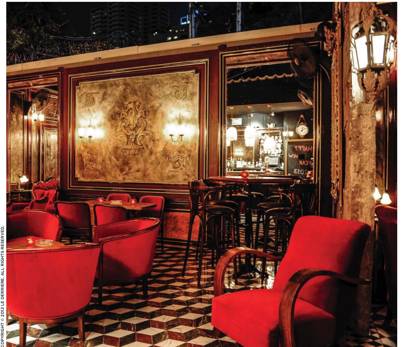
COPYRIGHT © 2012 LE DERRIERE. ALL RIGHTS RESERVED.

Oskar Bistro 24 Soi Sukhumvit 11 (next to Bed Supperclub) +662.255.3377 oskar-bistro.com