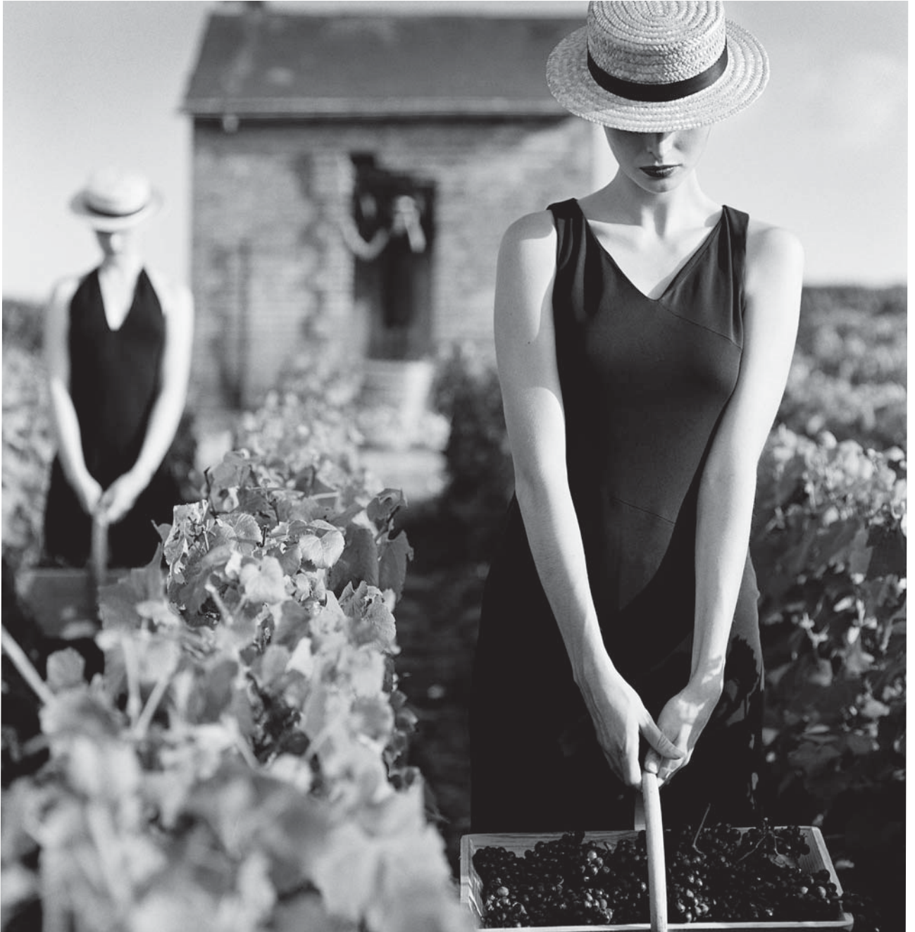
Women with baskets in Vineyard, Reims, France, 1997