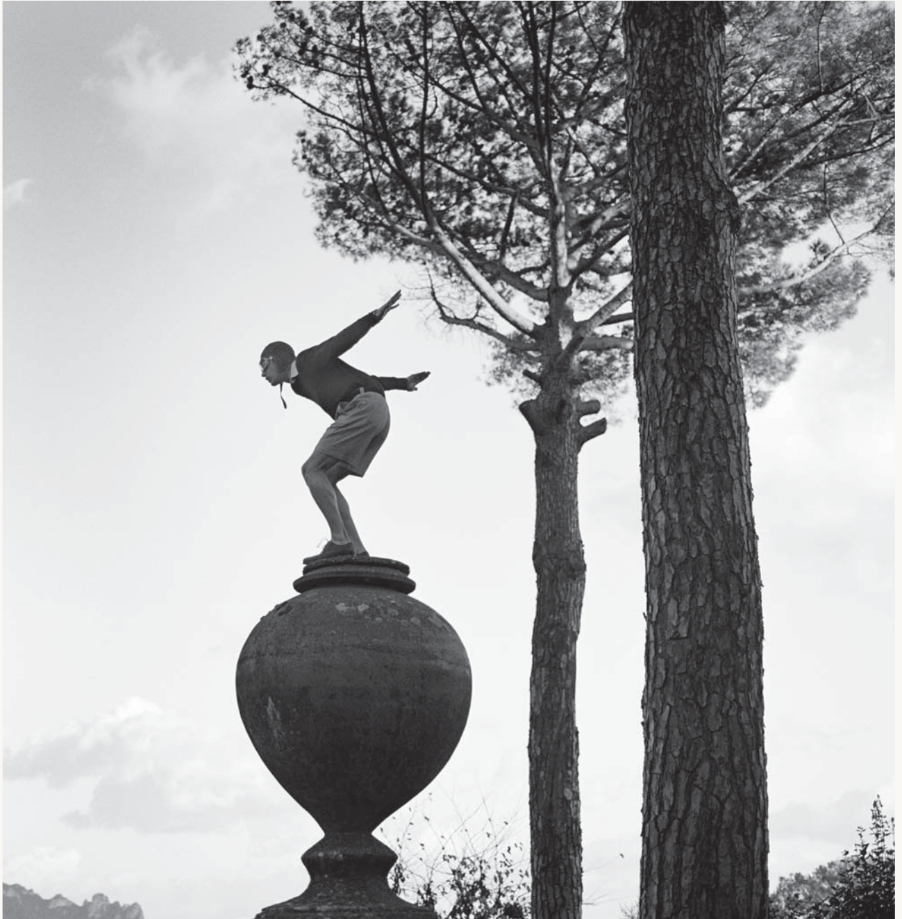
MASSIMO PERCHED ON URN, RAVELLO, ITALY 2007