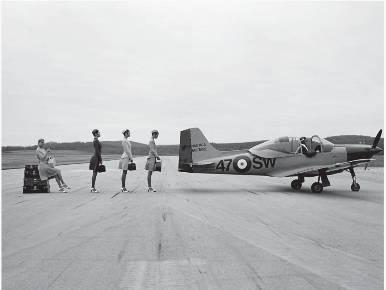
AIRLINE NO. 2, ORANGE COUNTY AIRPORT, NEW YORK, 1994